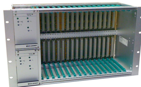
6U VME Backplane, mounted in a KM6 II subrack with Europower power supplies

KM6-II Eurocard subrack range and powered with Europower GK120 power supplies