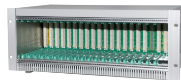
Eurotec Caseframe 19 inch Rack Mounting