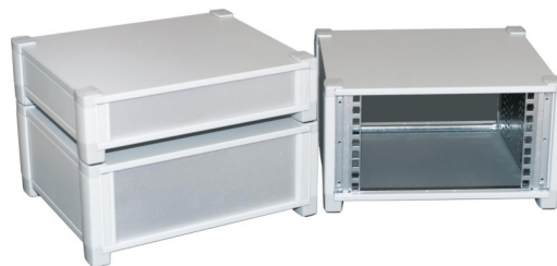
1U, 2U & 3U Verotec Cases painted in RAL 7035 powder paint

Finally Verotec offers a complete customization service for the Verotec case. Using 3D modeling software it is possible to design modified panels to better suit specific applications.